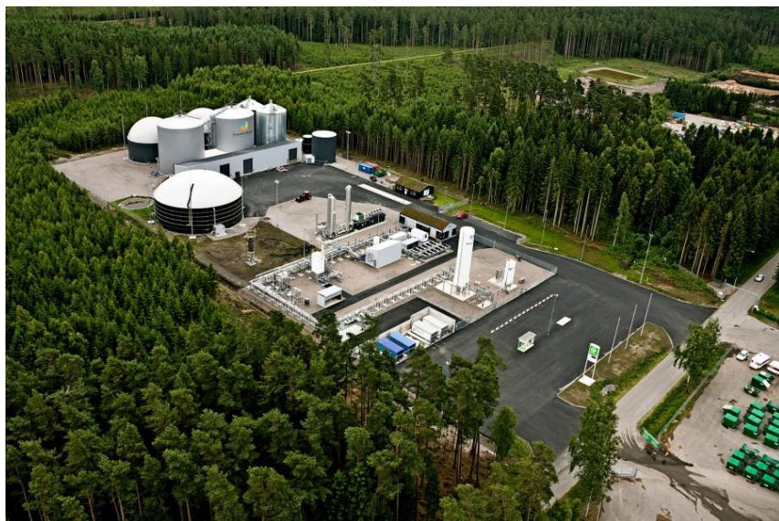
Lidköping Biogas: one of the world's first plants for liquefied biogas, as to fuel cars and trucks more

The AMFI Newsletter is prepared for the members of the Implementing Agreement for Advanced Motor Fuels of the International Energy Agency (IEA/AMF). The AMFI releases four electronic newsletters each year. A group of authors prepares contributions to this newsletter: